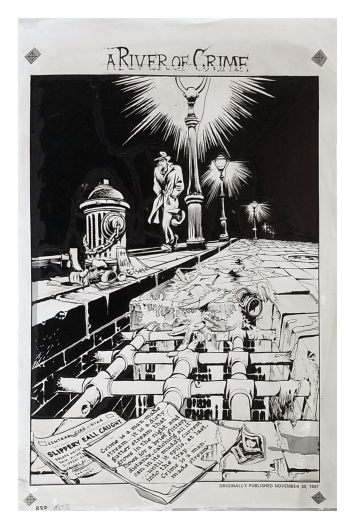
passed away in 2012.

Pasadena, California – July 10, 2018 – Gallery 30 South , Pasadena's popular gallery for emerging and internationally renowned artists and pop culture enthusiasts, has announce an extraordinary limited engagement exhibition titled "Pop Sequentialism Ver. 2.0" to open Sunday, July 15, 2018 and run through mid-August.